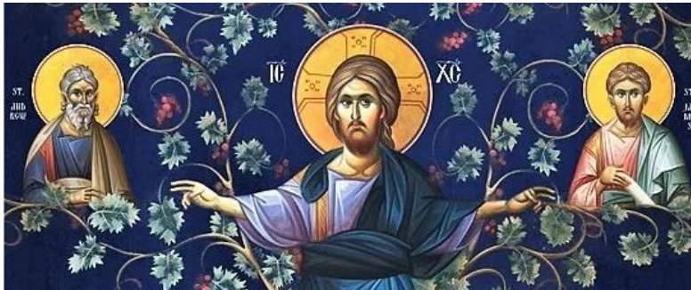
Christ the True Vine (20th century), Dormition Convent, Parnes, Greece